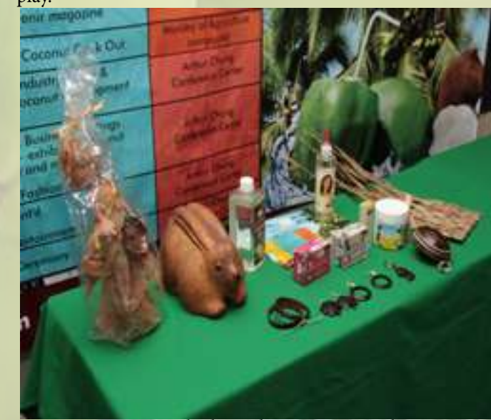
Items on display at the Coconut Festival.

At the conference on September 1, various value-added coconut products such as soaps, oils, skin creams, coconut milk and bottled coconut water among other products were on dis-