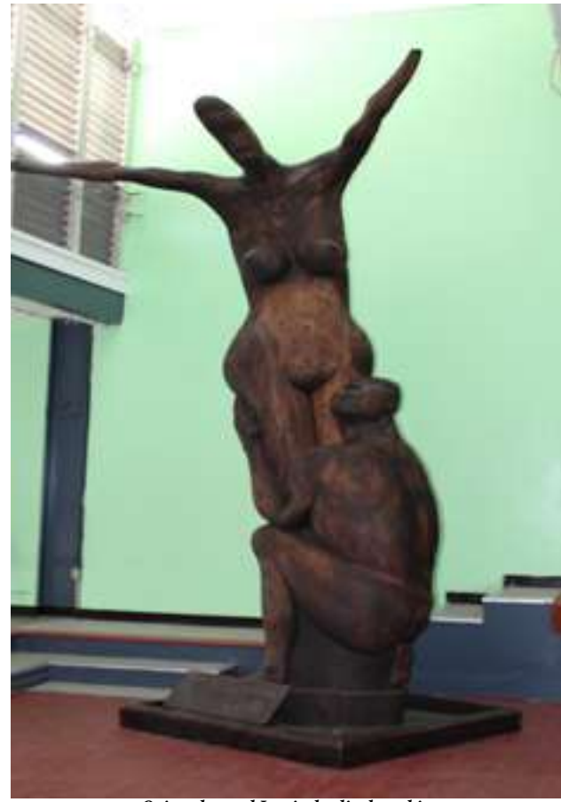
Orinooko and Imoinda displayed in George Walcott Lecture Theatre (GWLT)

You can find this sculpture in the George Walcott Lecture Theatre at the Turkeyen campus.