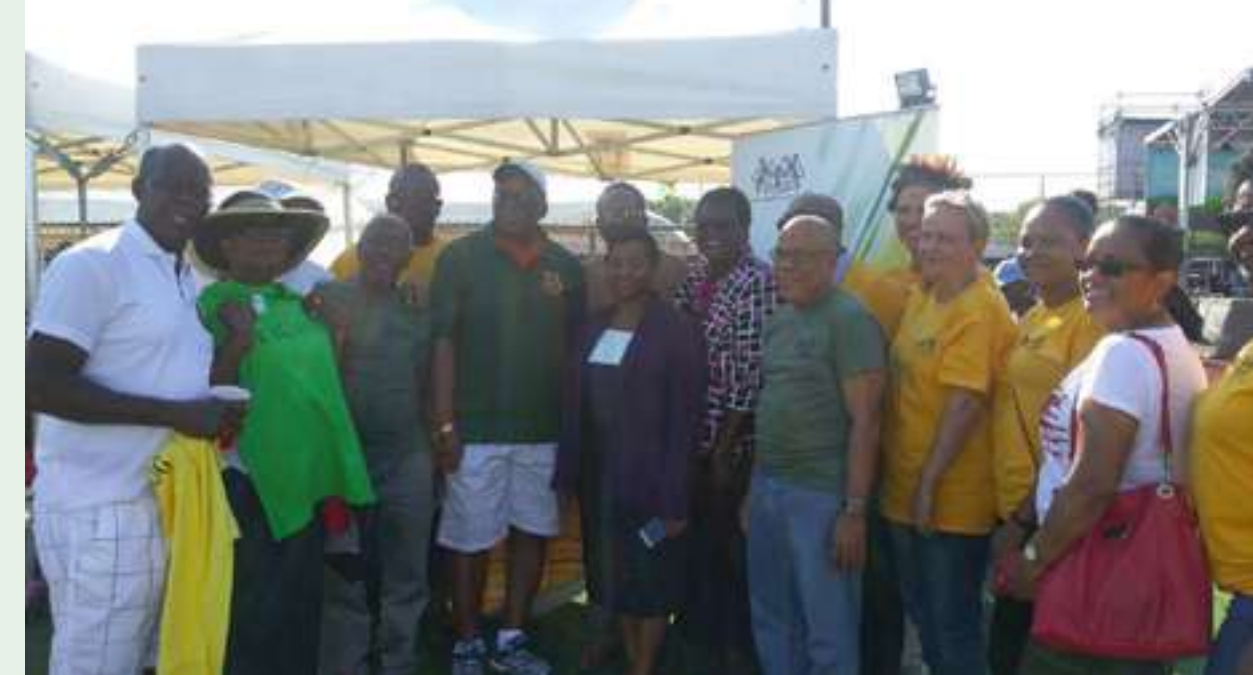
ABOVE: The Vice Chancellor and his team at the Renaissance meeting in New York.