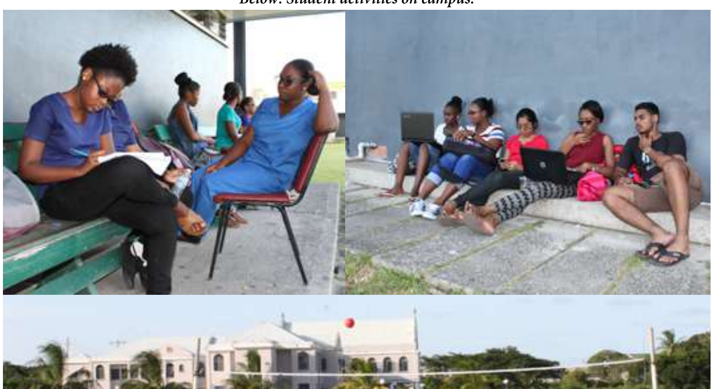
Top: A section of students, in the George Walcott Lecture Theatre (GWLT) in one of their first classes. Below: Student activities on campus.